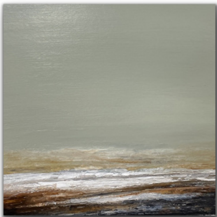
Seascape #20 Oak Frame