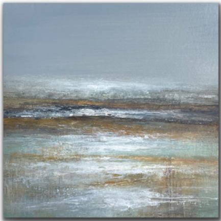
Seascape #8 White Frame