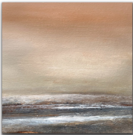
Seascape #23 White Frame