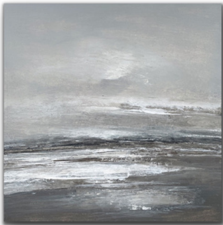
Seascape #13 White Frame