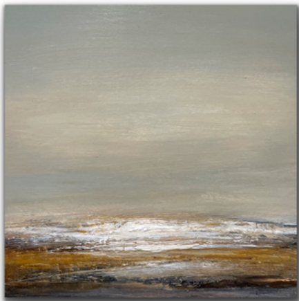
Seascape #18 Oak Frame