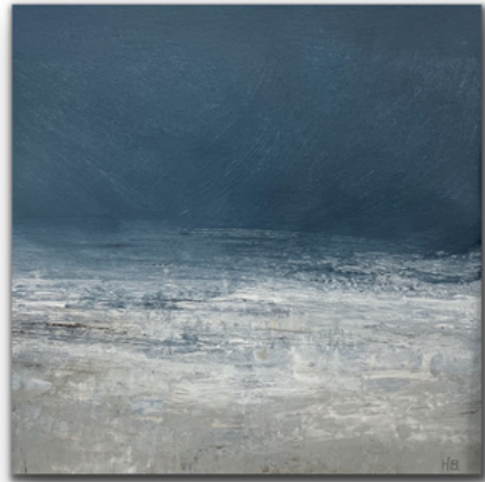
Seascape #22 White Frame