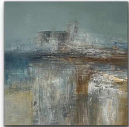
Landscape #4 Oak Frame