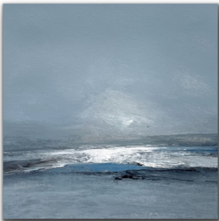
Seascape #15 White Frame