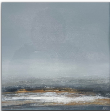
Seascape #25 White Frame