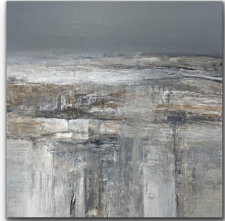
Landscape #2 Oak Frame