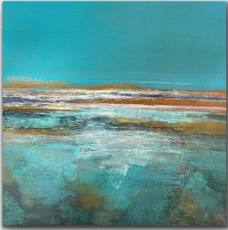
Seascape #1 White Frame