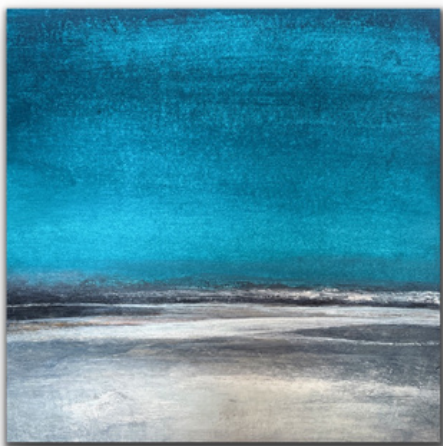
Seascape #5 White Frame