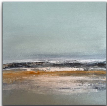
Seascape #24 White Frame