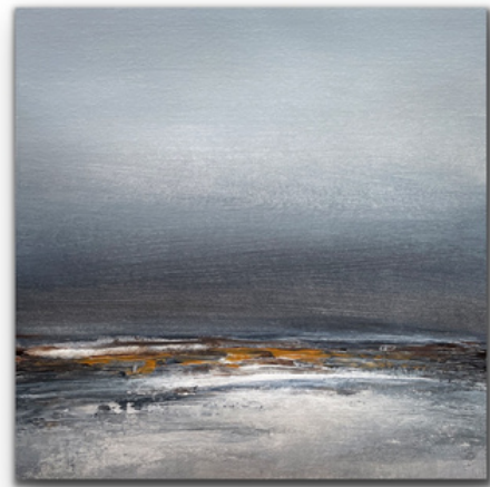
Seascape #4 White Frame