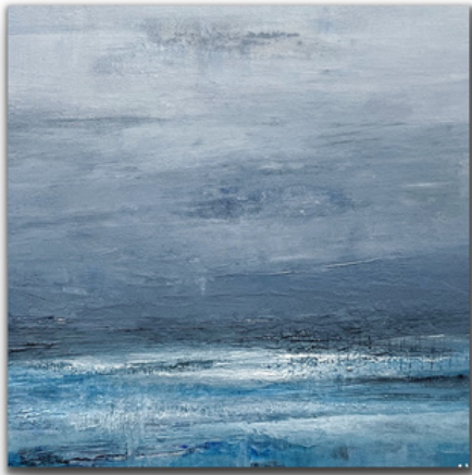
Seascape #21 White Frame