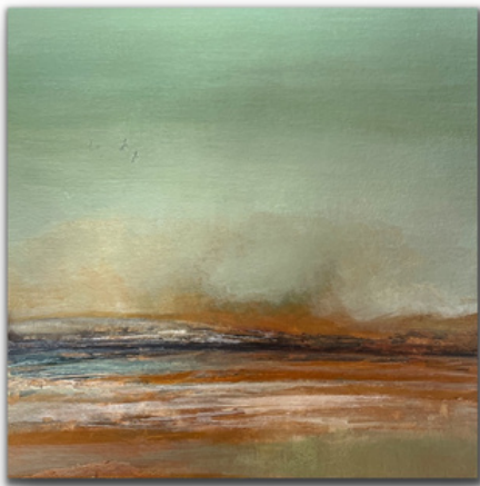
Seascape #3 Oak Frame