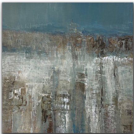
Landscape #5 White Frame