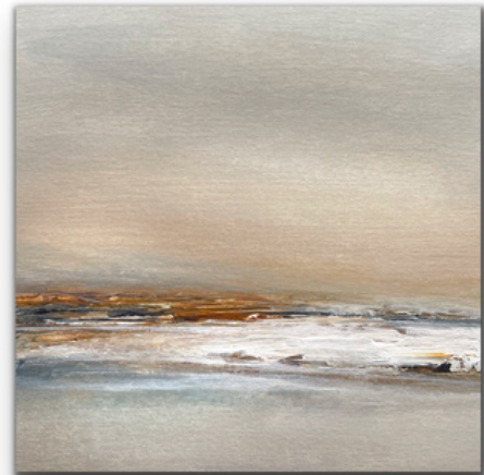
Seascape #9 Oak Frame