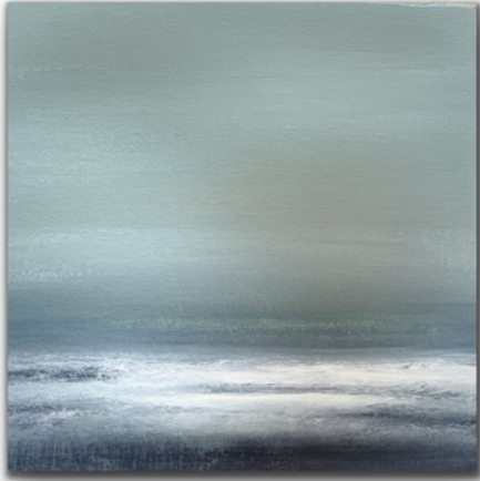
Seascape #6 White Frame