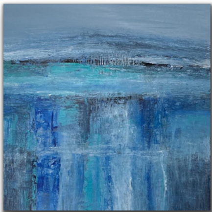
Seascape #10 White Frame