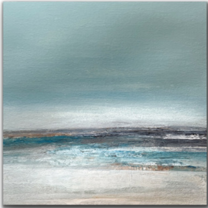
Seascape #16 White Frame