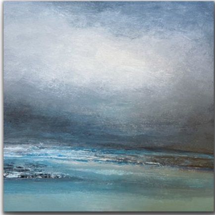
Seascape #11 White Frame