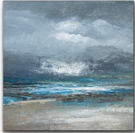
Seascape #12 White Frame