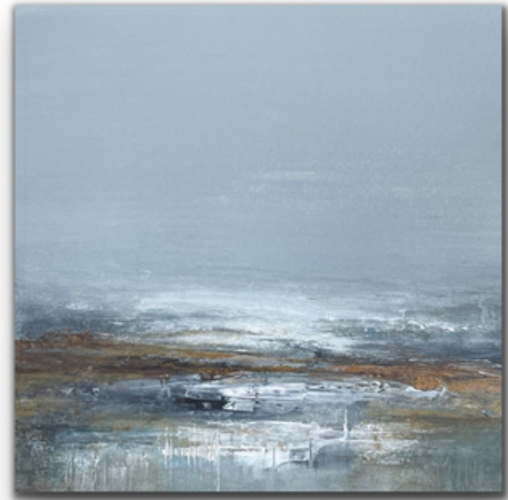
Seascape #7 White Frame