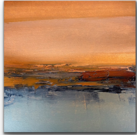
Seascape #2 Oak Frame