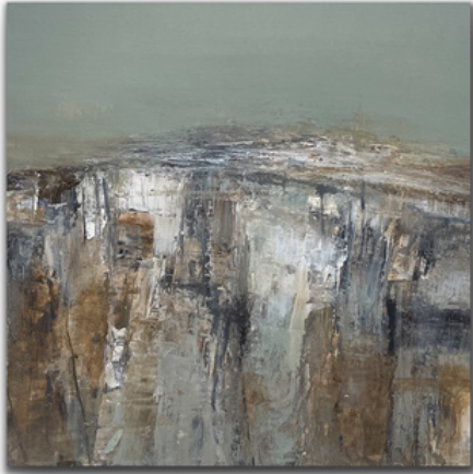
Landscape #1 Oak Frame