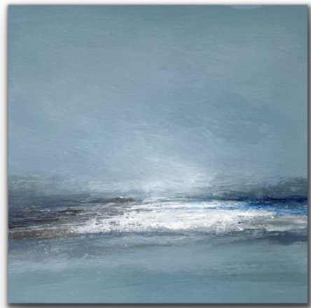
Seascape #14 White Frame