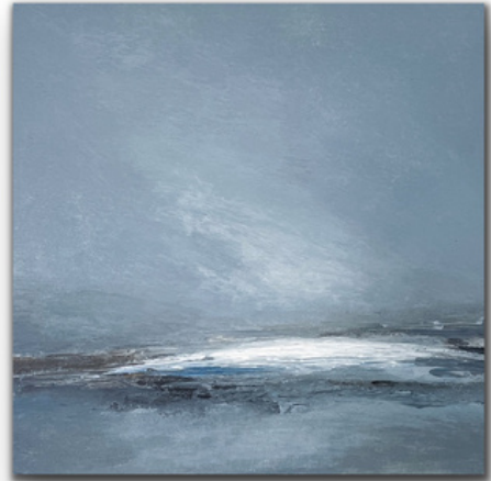
Seascape #17 White Frame