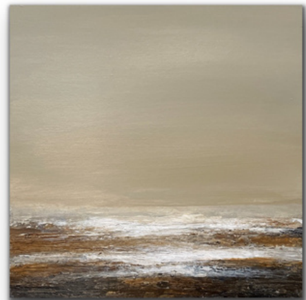
Seascape #19 Oak Frame