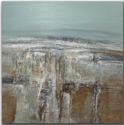
Landscape #3 Oak Frame